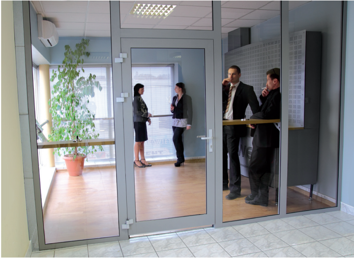
Arrangement example of the SMOKE ABSORBER in a special space within a building