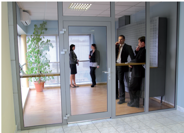
Arrangement example of the SMOKE ABSORBER in a special space within a building